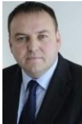
Pádraig Mac Lochlainn TD