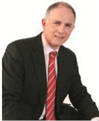
David Stanton TD